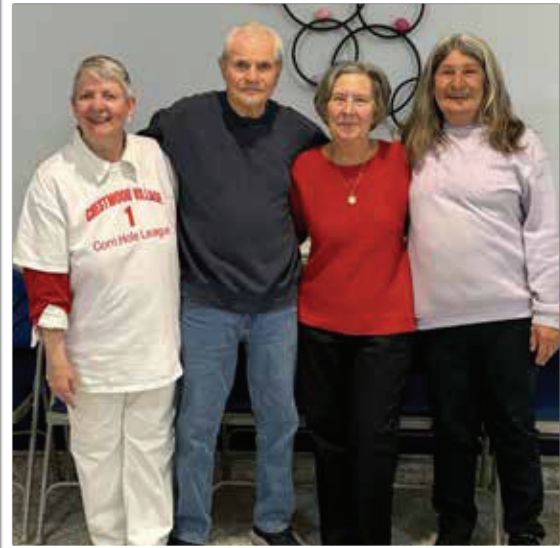
Corn hole Champions