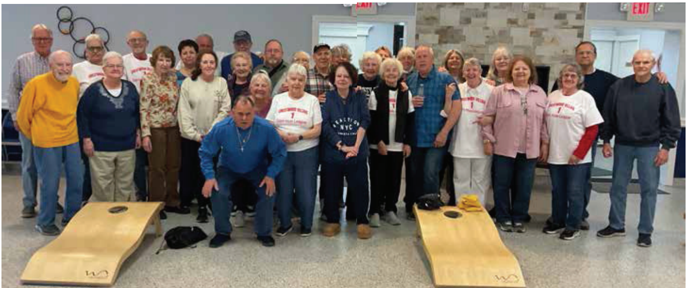
THE CREW - "Tossin' Bags and Making Legends"