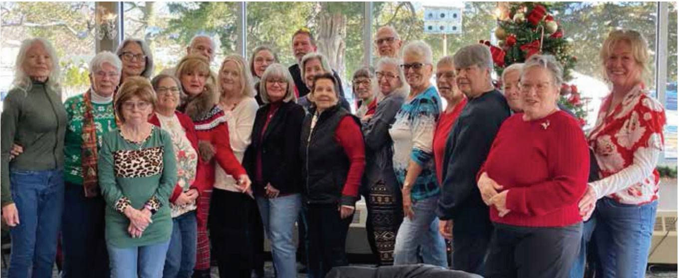
Ceramic Club Christmas Luncheon Held at Captains Inn 2025