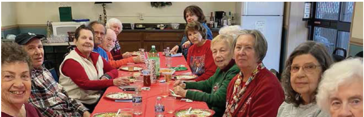
Poker/Domino Christmas Luncheon 2025