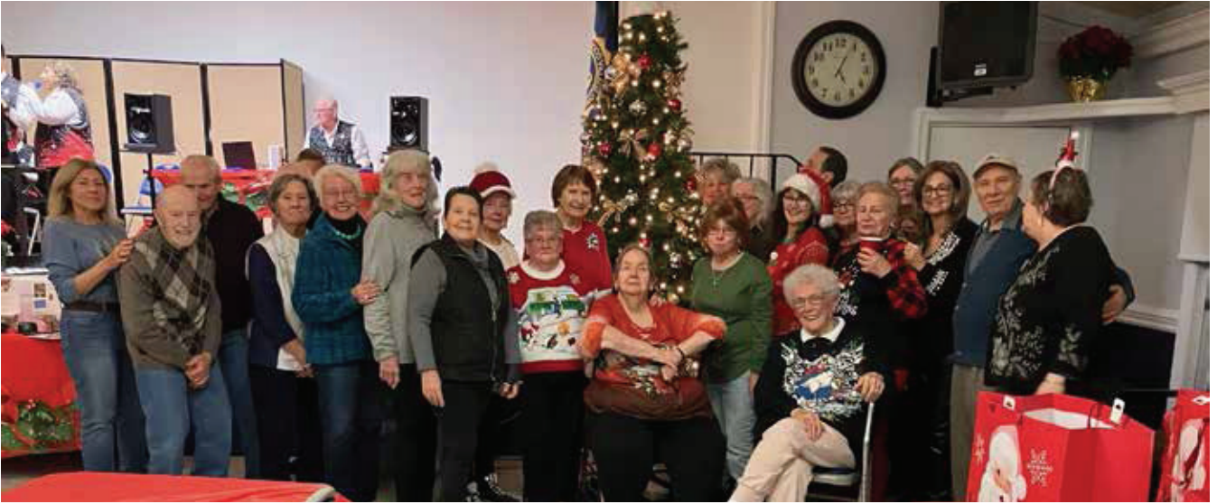
Resident Club Holiday Dinner 2025